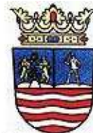
Győr Moson Sopron HUN